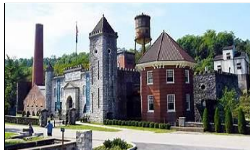
Castle & Key Distillery

Following a group breakfast at Trustee's Table , we partake in The Civil War at Pleasant Hill 1-hour tour. Soldiers from both armies received generous hospitality from the Shakers during the war. We have an (Included) lunch at The Brown Barrel in Frankfort, KY then take a short bus ride to Castle & Key Distillery , where we take a journey through time in this historic site and conclude our visit with a classical, speakeasy style tasting room. Down the road we take our last distillery tour at Whiskey Thief Distilling Co. Their claim to fame: offering KY Bourbons & Rye Whiskeys straight from barrel – uncut & unfiltered. This evening will find us at the Holiday Inn Express-Versailles . After check-in and a brief time in the room we depart for an (Included) Upscale Dinner at Azur Restaurant & Patio . The rest of the evening is at your leisure. Included Meals Today: Breakfast, Lunch, Dinner