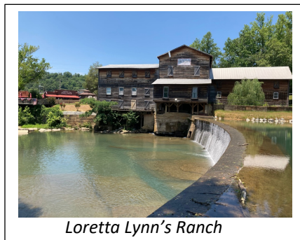
Loretta Lynn's Ranch